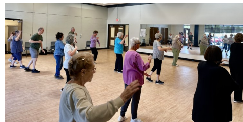
Members working out in the group fitness studio.